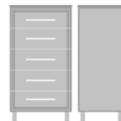
CCCH50 25W 19D 46.75H