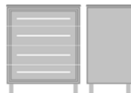
CCCH40W 31.5W 19D 36H