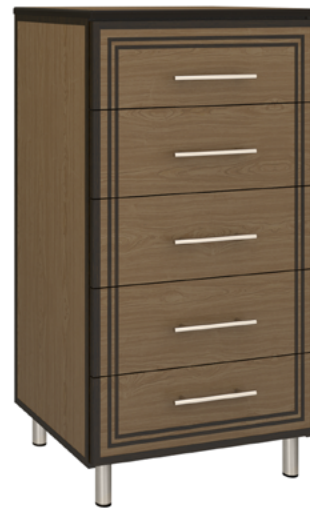
Model: CCCH50 25W 19D 46.75H

The Chicago Collection is sturdy and stylish in a modern or transitional setting. Easy handle and knob recognition and distinct color contrasts are made possible with a variety of custom hardware and wood-grained finishes. The contrasting finishes can be customized or alternated with aluminum inserts.